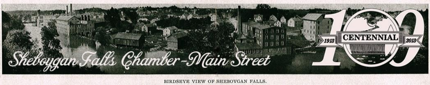
BIRDSEYE VIEW OF SHEBOYGAN FALLS.